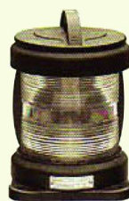
CXH3-11P Full Plastic Masthead Light