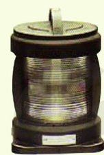
CXH4-11P Full Plastic Sternlight