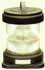
CXH6-11P Full Plastic All-round Light