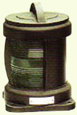
CXH1-11P Full Plastic Starboard Light