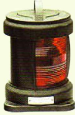
CXH2-11P Full Plastic Port Light